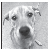
STAMOS 9 Mo Old Male - Sweet Playful Loving Boy.