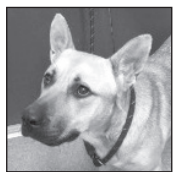
TOM 2 Yr Old Male - Handsome Shepard Mix

These beautiful animals are at Franklin County Animal Control, 351 T. Kemp Rd, Louisburg, NC just waiting for someone to give them a home. For adoption information, call 919-496-3032. Please hurry!