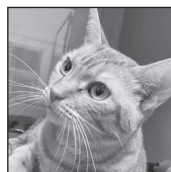
BUFFY Adult Female - Calm Quiet Snuggly Girl.